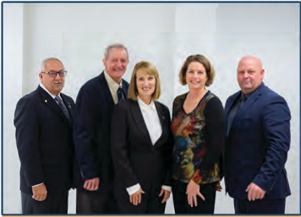
2022-2026 Municipal Council

Thank you for being part of our community: Our Home / Notre-Chez Nous. We look forward to a fantastic year, full of exciting developments and memorable events.